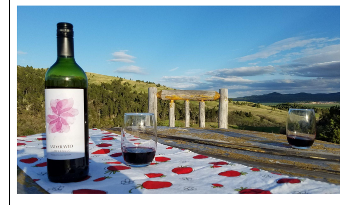
Enjoy a picnic on the Ridgeline Trail!